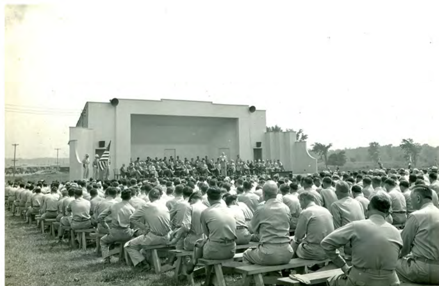
Amphitheater South Side of 10th Street (near the bottom) between Arlington Drive & Route 18