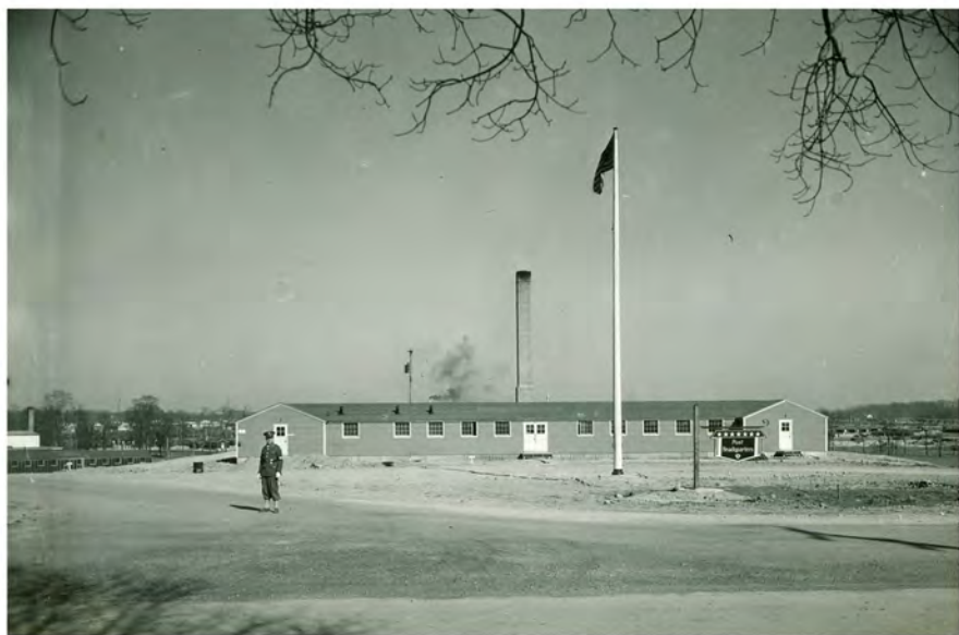
Camp Headquarters - September 1942