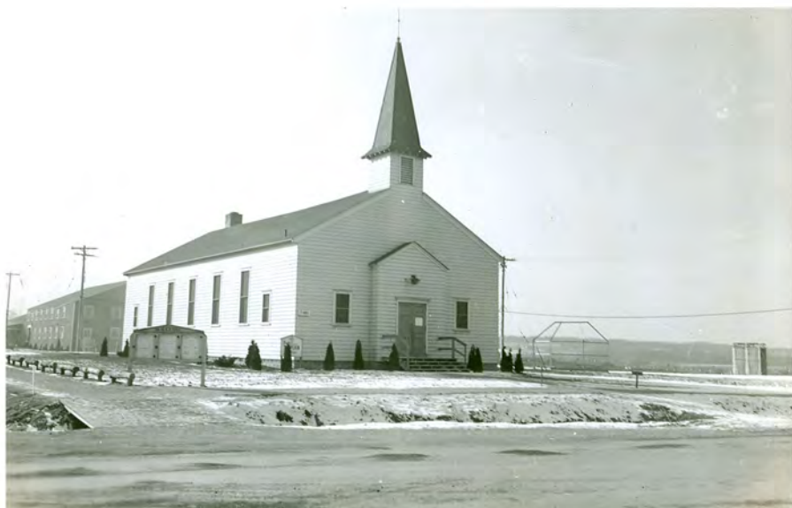
Chapel - Building # T-985 North Side of 10th Street (at the bottom) between Arlington Drive & Route 18