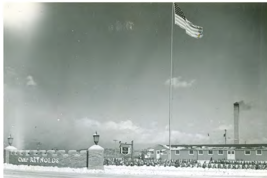
Camp Headquarters - Winter of 1943